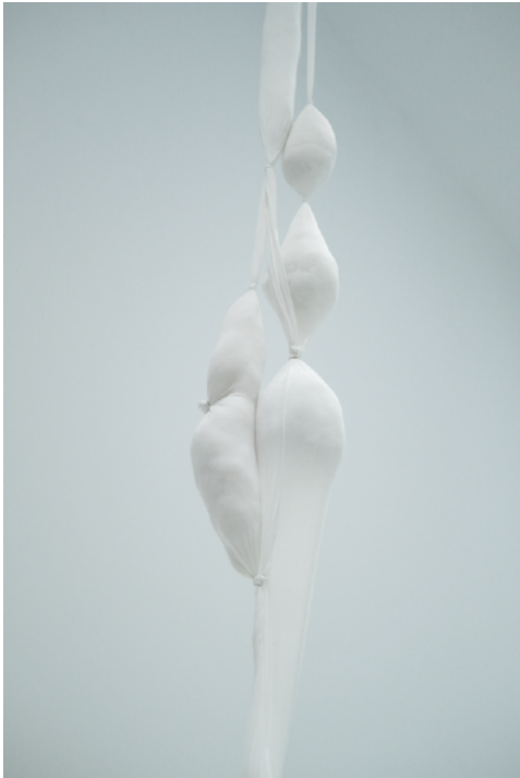
Figure B, 2024-2026 Nylon, polyester fiberfill, rock Dimensions variable