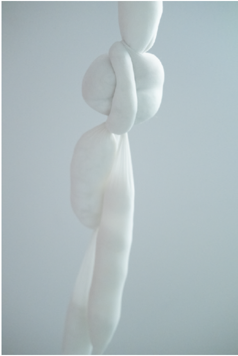
Figure A, 2024-2026 Nylon, polyester fiberfill, rock Dimensions variable