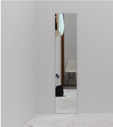
Point of View, 2026 Mirror, designer chair Dimensions variable