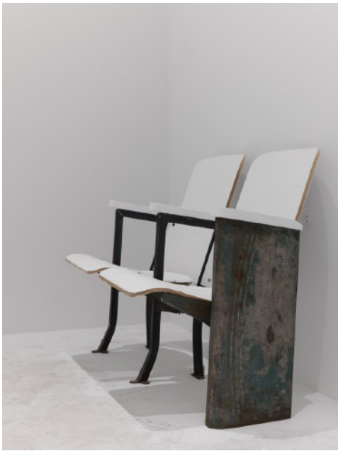
Theater Chairs, 2026 Vintage theater seats, paint stripper, joint compound, paint 31 x 41 1/2 x 24 in