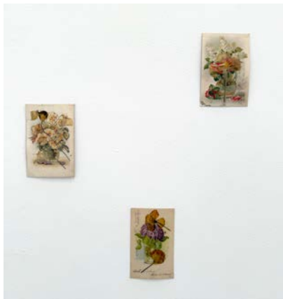
David Horvitz Untitled , 2025 9 postcards (postcard, garden materials, tape) 5 1/2 x 3 1/3 in (each)