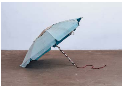
Carlos Agredano Parasol , 2023 Parasol 81 x 71 in