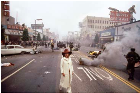
Douglas Kirkland Jeanne Moreau on Hollywood Boulevard , 1970 Photograph 24 x 30 in