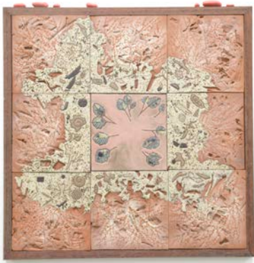
Anais Franco Ground Study , 2025 Ceramics 24 1/3 x 24 1/3 in